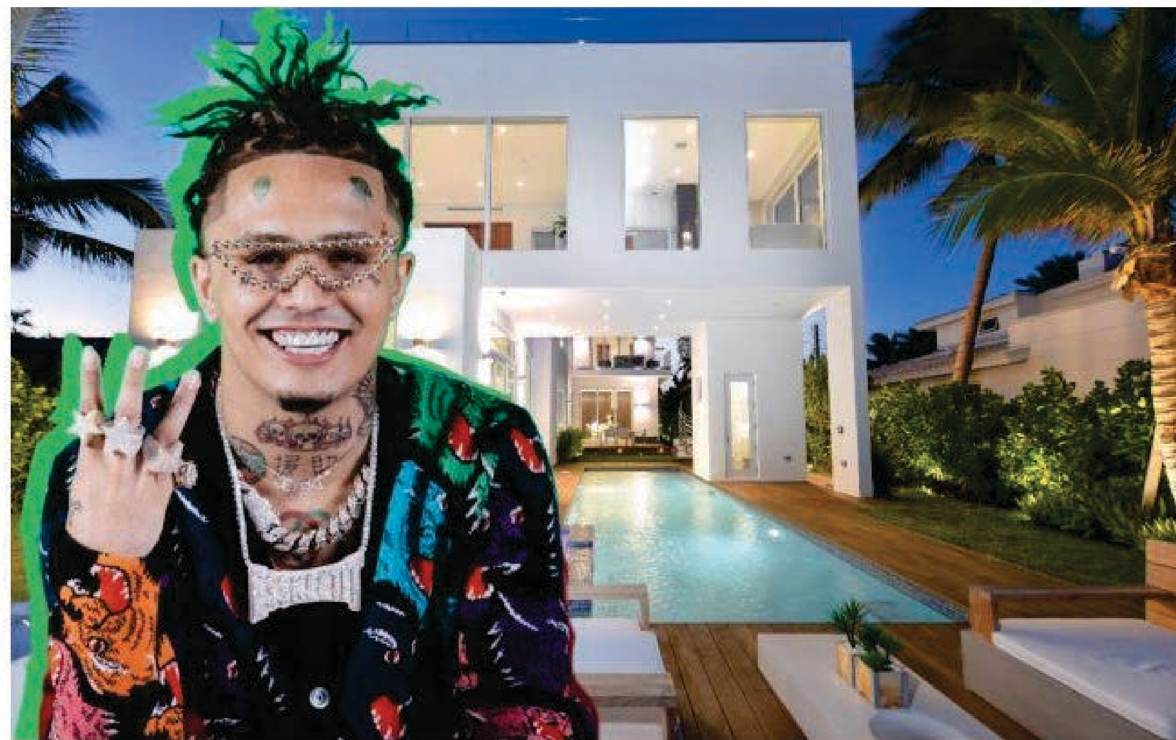
Lil Pump and his Bay Drive home

Instead of “ten racks on a new chain,” rapper Lil Pump just dropped $4.6 million on a new waterfront home.