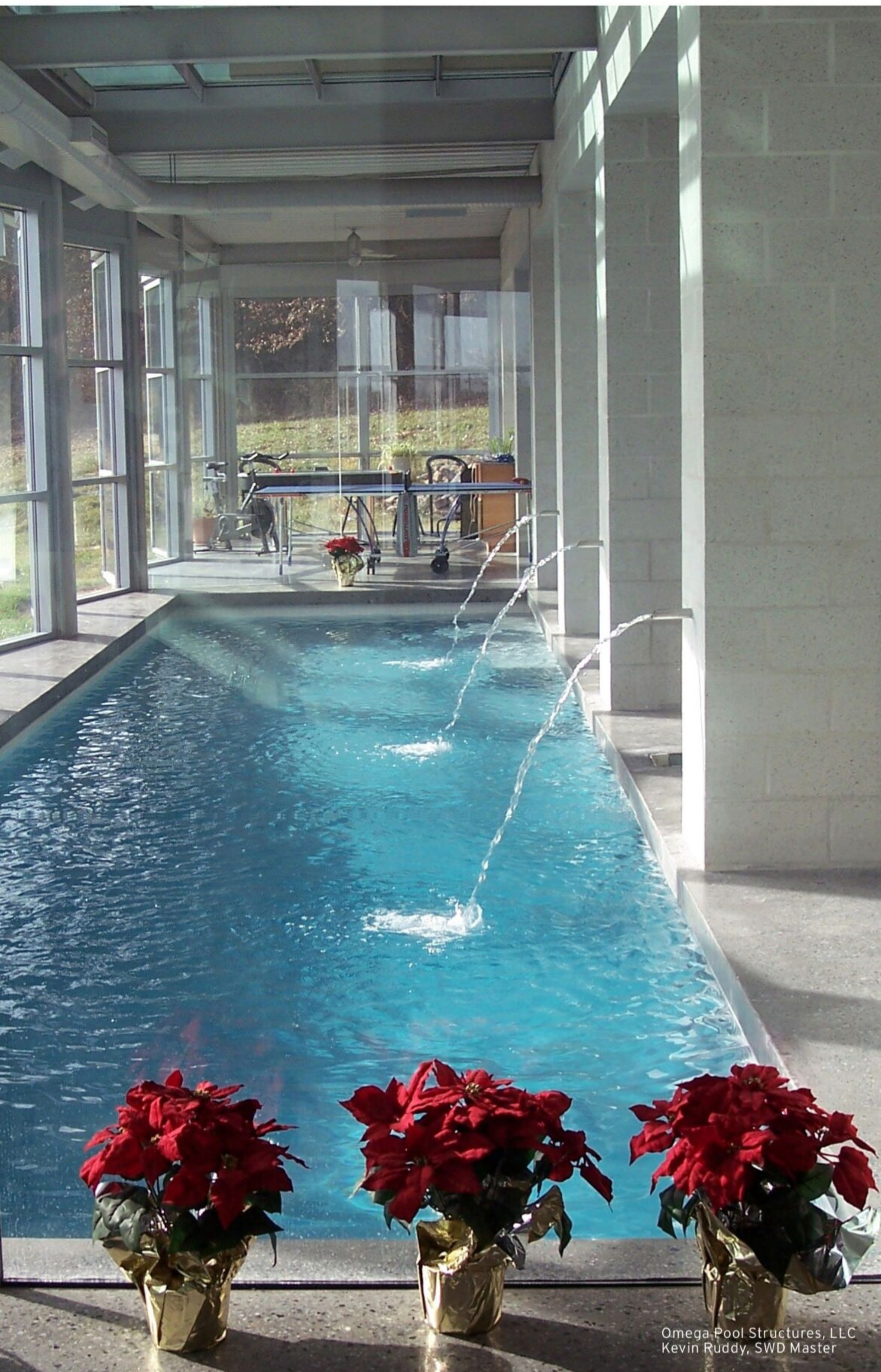
Omega Pool Structures, LLC Kevin Ruddy, SWD Master